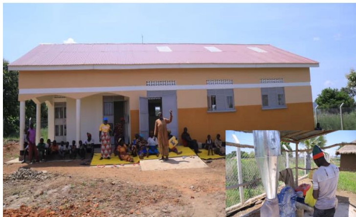
Matching Grants beneficiaries Binagoro Women's group, Yumbe district at their facility offer milling services to the community