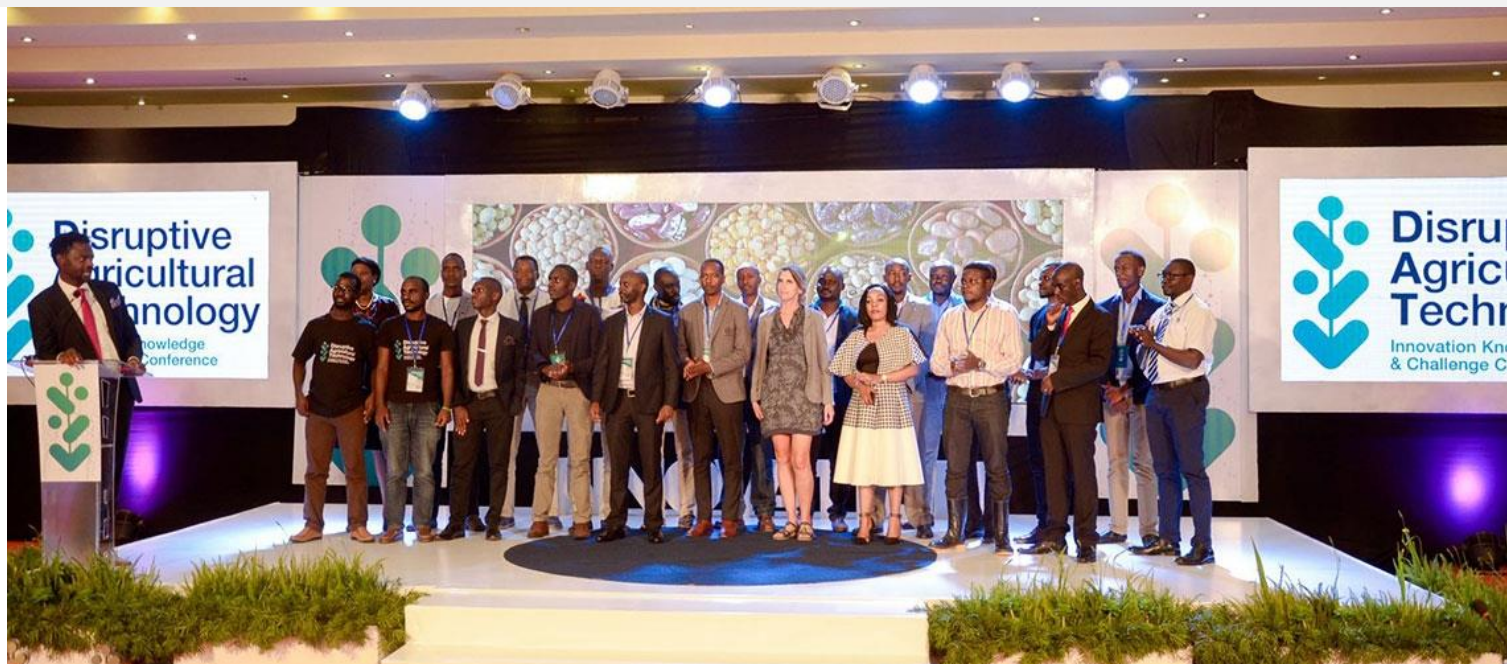
Selected Agri-Tech firms at the Disruptive Agriculture Technologies challenge- Munyonyo Resort Hotel- Kampala