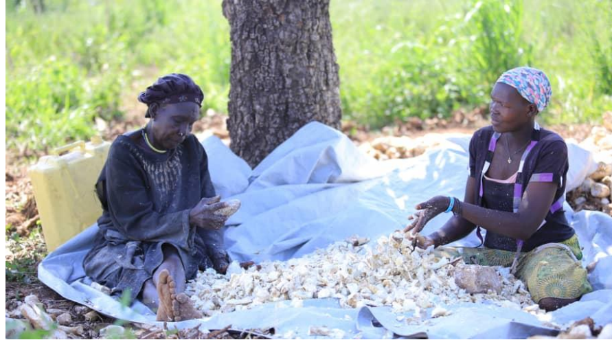
Group members crash cassava into smaller pieces ready for drying